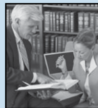
Legal Fees Loan

We Also Have Loans For: New Roof • Medical Expenses • Appliance Repair/Purchase • And More