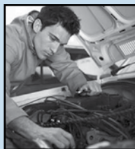
Car Repair Loan