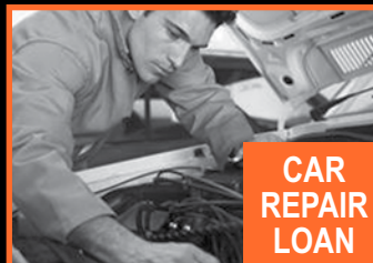
CAR REPAIR LOAN