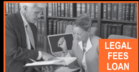
LEGAL FEES LOAN